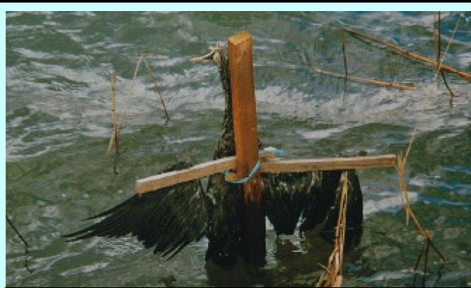
Crucified Cormorant: a potent symbol of the pan-European cormorant/fisheries conflict.